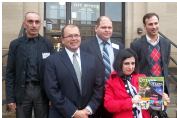
Mayor of Ottawa meets with Deputy Mayor and Committee Members from Georgia!