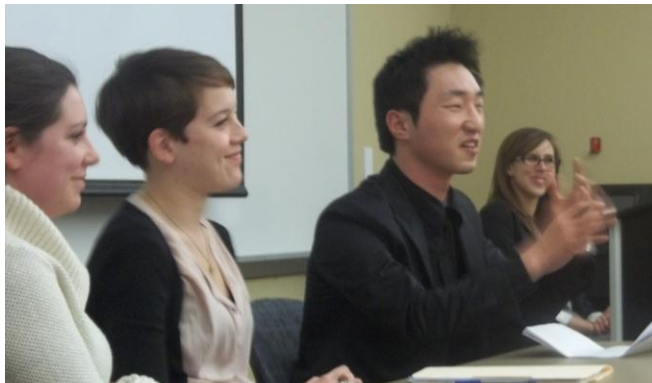
CIP participants on a panel presentation on "Emerging Global Youth Movement" at the Loyola University School of Law