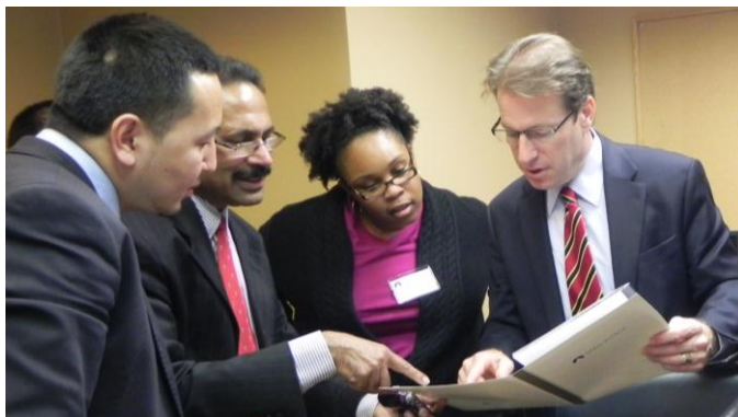
Congressman Roskam reviews Open World report along with delegates from Kyrgyzstan