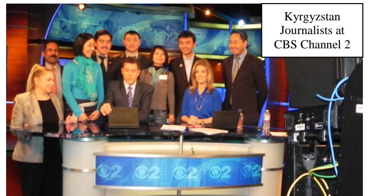
Kyrgyzstan Journalists at CBS Channel 2