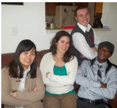
CIP Interns experiencing the joy of practicing what they learned – "CIP is a great place for Service Learning"

The Council of International Programs, 4254 N. Hazel St. Chicago, IL 60613, 630-359-3393, gp@cipchicago.org