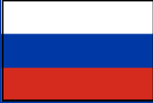
Above: The flag of the Russian Federation